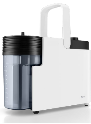
Light Weight & Compact